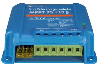
SmartSolar Charge Controller MPPT 75/15