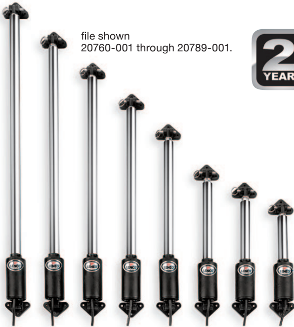
file shown 20760-001 through 20789-001.